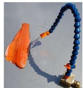
Fig 1. M35KT Ozone kit offers a food safe solution

The M-35KT system can be used continuously during production (tables, cutting boards, etc...) OR as a mobile flood sanitizer with the included 25ft hose/wand. It's great for treating the receiving area and/or using as a replacement for chemical sanitizers during sanitation. The ozone resistant heavy duty PEX tubing (included) is simple to install with the provided quick connect fittings and wall clamps.